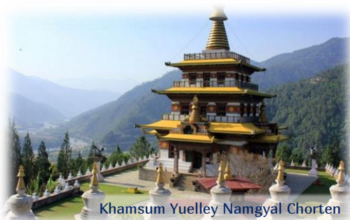
Khamsum Yuelley Namgyal Chorten