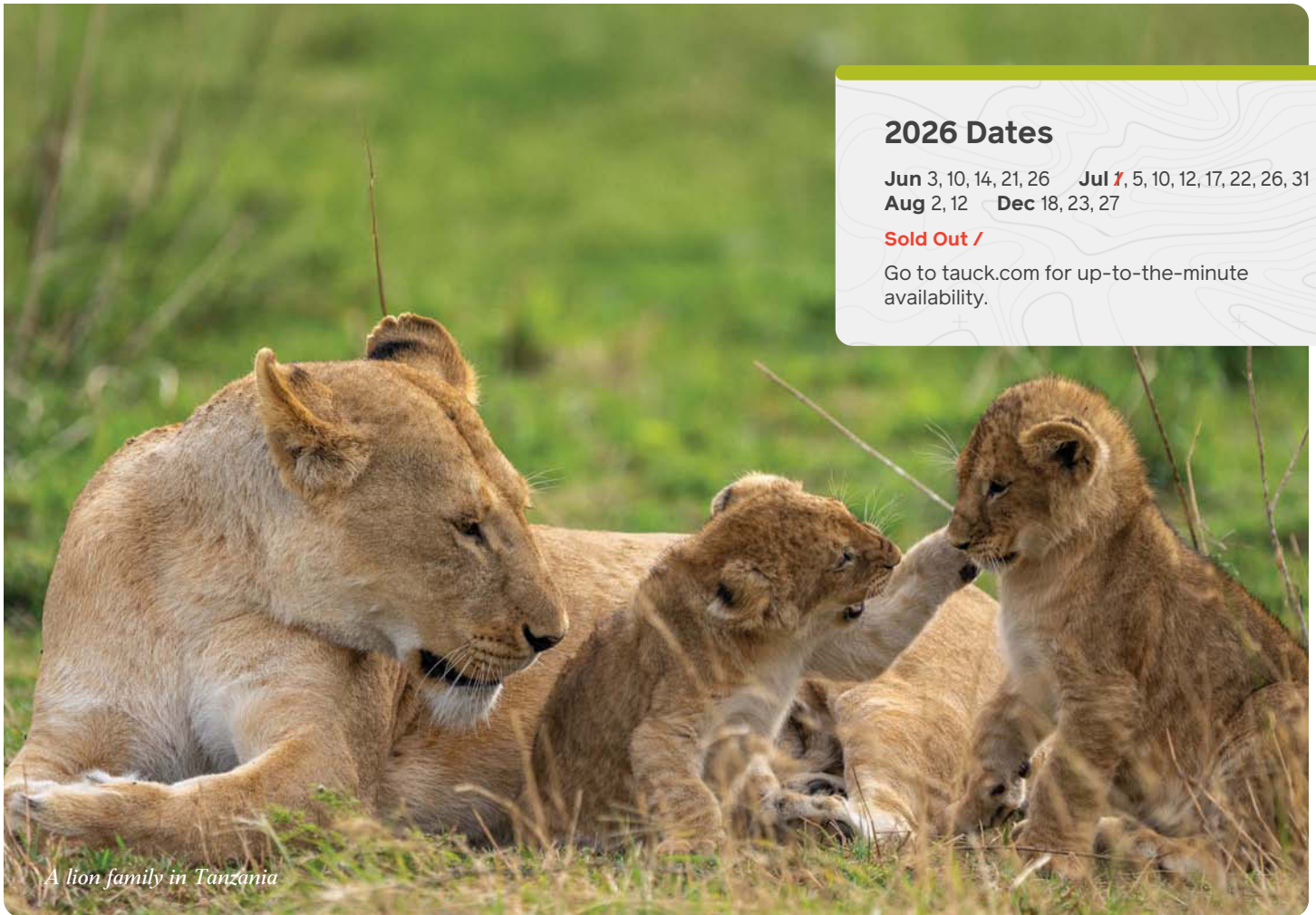
A lion family in Tanzania