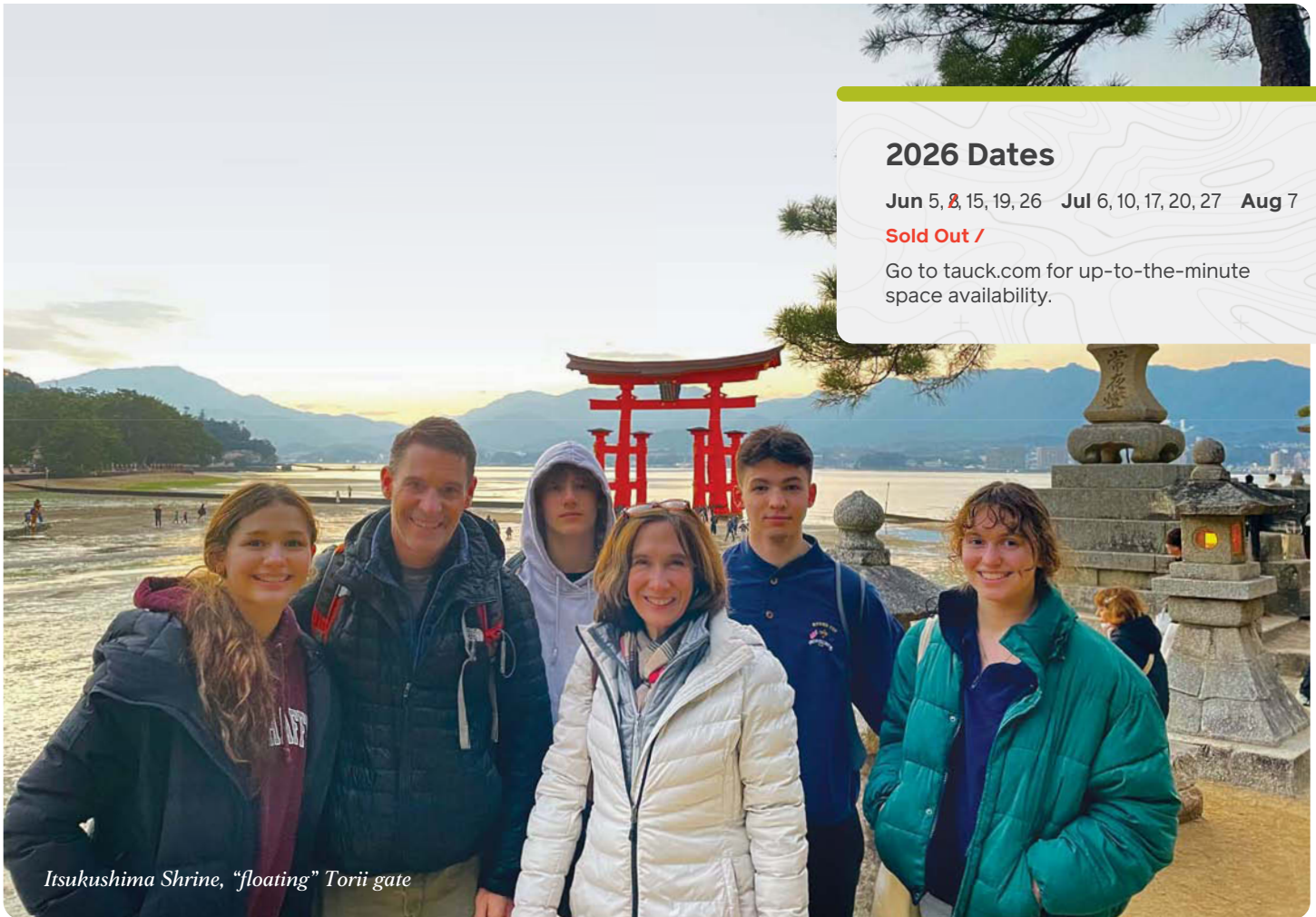
Itsukushima Shrine, "floating" Torii gate

Go to tauck.com for up-to-the-minute space availability.