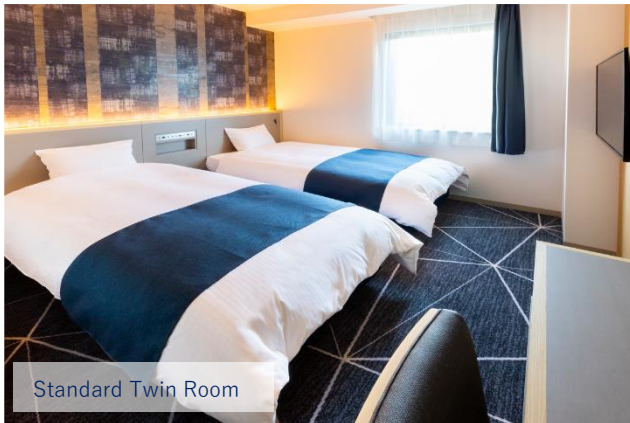
Standard Twin Room