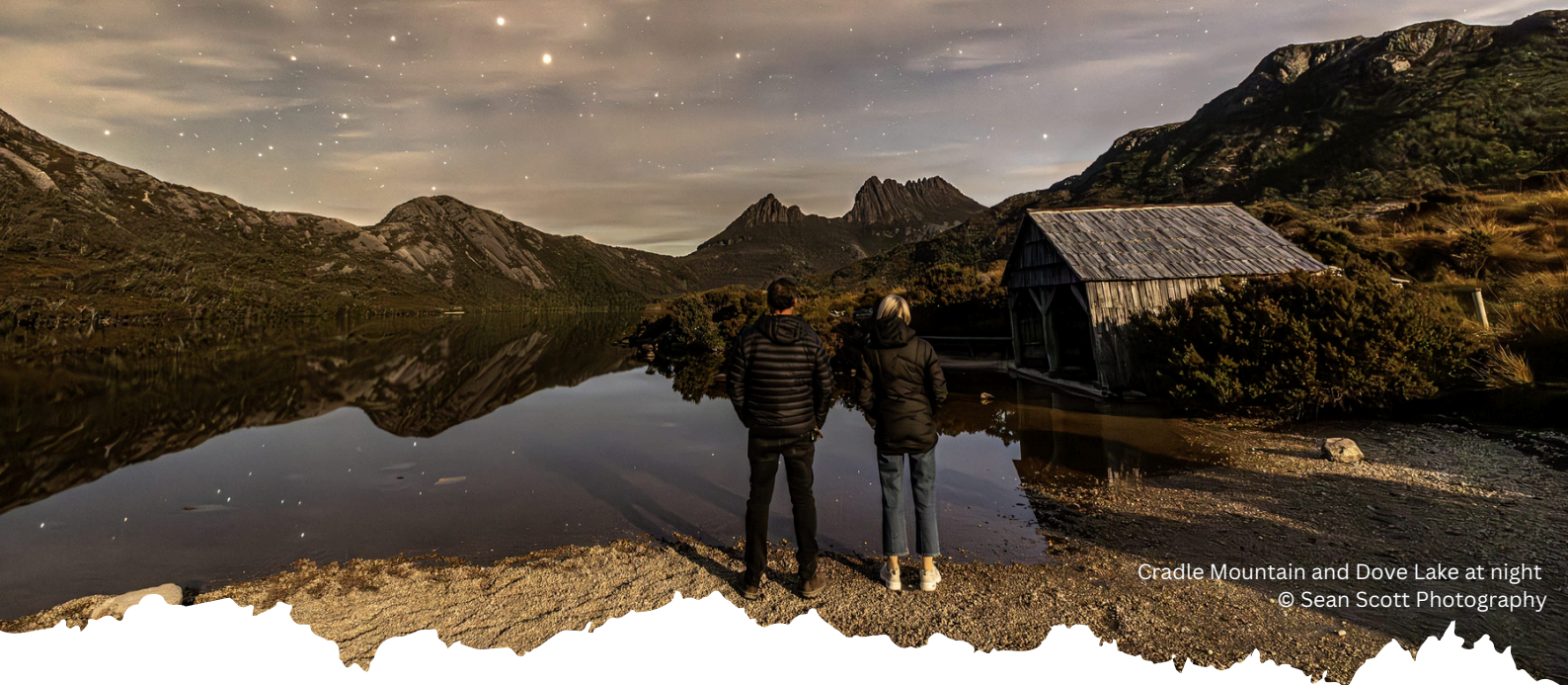
Cradle Mountain and Dove Lake at night